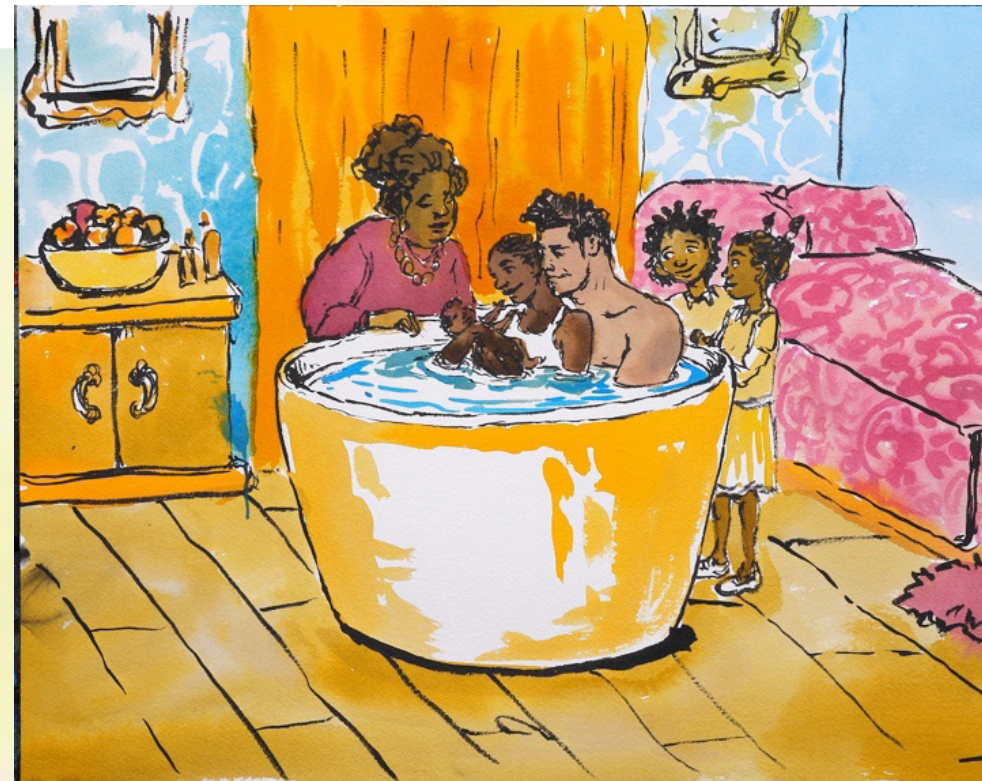
Midwifing Justice video artwork by Molly Crabapple/Sharp As Knives

BCE launched the first-ever Birth Center Week September 14-20, 2023. The purpose of the annual Birth Center Week is to celebrate and elevate the impact and potential of birth centers, with a focus on community birth centers that provide safe, culturally-reverent, midwifery-led health care for all. Birth Center Week is growing the collective cultural, economic, and political power of community birth centers led by Black, Indigenous, people of color.